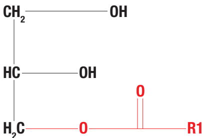
Figure 1. Monoglyceride Chemical Representation in MaxSimil Fish Oils (R1 = fatty acid)

Unique structure: One fatty acid attached to a glycerol backbone provides two polar ends that attract water and a non-polar tail end (R1) that attracts fat, thus enabling self-emulsification of the Ultra Omega formulas.